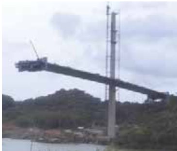
LENTON couplers are designed for use on worldwide standard grades of rebar.