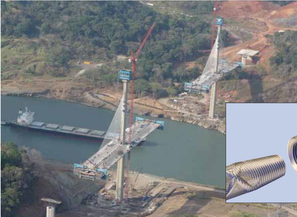
At 1,050 meters, the Puente Centenario is the longest cable-stay bridge in Latin America. LENTON® couplers provided time savings and cost efficiencies to the project.