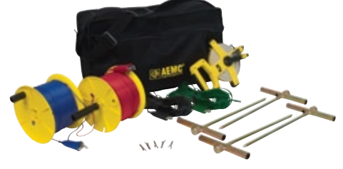
Test Kit for 4-Point testing includes two 500 ft color-coded leads on spools (red and blue), two 100 ft color-coded leads (green and black), one 30 ft lead (green), four 14.5" T-shaped auxiliary ground electrodes, one set of five spaded lugs, 100 ft tape measurer and carrying bag. Catalog #2135.37