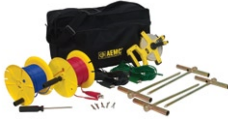
Test Kit for 4-Point testing includes two 300 ft color-coded leads on spools (red and blue), two 100 ft color-coded leads (green and black), four 14.5" T-shaped auxiliary ground electrodes, one set of five spaded lugs, 100 ft tape measurer and carrying bag. Catalog #2135.36