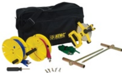
Test Kit for 3-Point testing includes two 150 ft color-coded leads on spools (red and blue), one 30 ft lead (green), two 14.5" T-shaped auxiliary ground electrodes, one set of five spaded lugs, 100 ft tape measurer and carrying bag. Catalog #2135.35