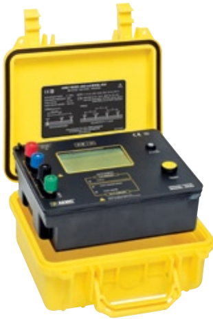
The Models 4620 and 4630 are built into a double case. This extra rugged construction provides double insulation, maximum field durability and ease of serviceability.