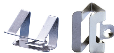
Versatile Thread Impression