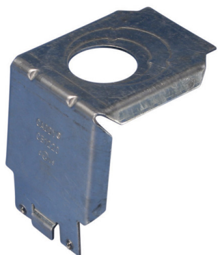
Box Eliminator Conduit Supports