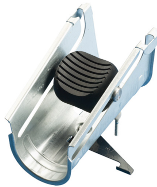
nVent CADDY Cat 600R Strut Mount Vertical Cable Support