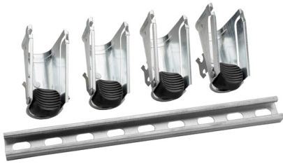
nVent CADDY Cat 600R Strut Mount Vertical Cable Support Kit