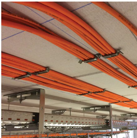
Clips, Clamps and Retainers