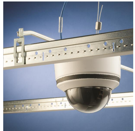
Security Camera Mounting Kits