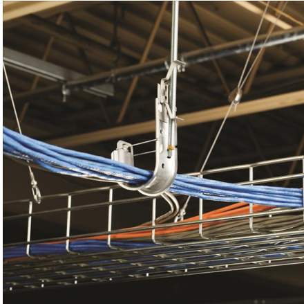
Cable Support Systems