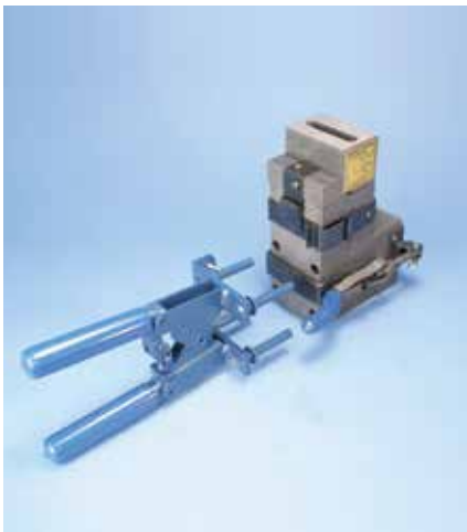
"E" and "J" Price Key Mold L160 or L159 Handle Clamp Required