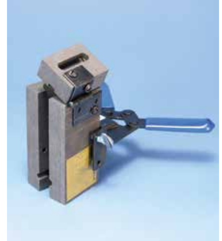
"T", "P" and "N" Price Key Mold Includes Mini-EZ Handle Clamp To order mold only, add an "M" suffix to the part number (for example, SST1TM)