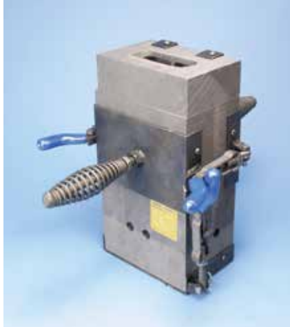
"G", "K", and "L" Price Key Mold Includes Frame with Handles