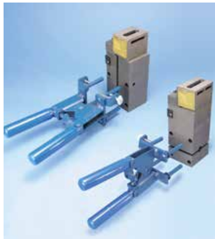
"C", "D", "F", "R", "Q" and "Z" Price Key Mold L160 or L159 Handle Clamp Required