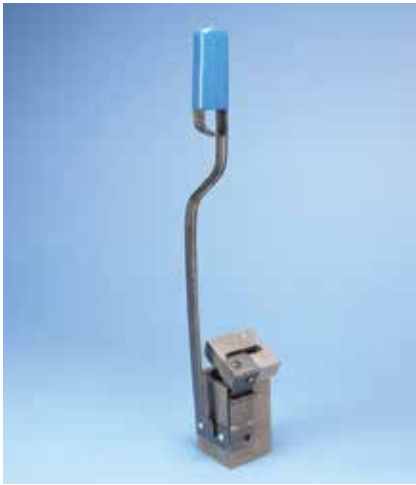
"A" Price Key Mold Includes Hold Down Frame

Pictured below are the molds and handle clamps / and or frames and handles for the various price key molds: