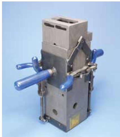
"M" and "V" Price Key Mold Includes Frame with Handles