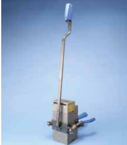
"H" Price Key Mold Includes Hold Down Frame with Handles